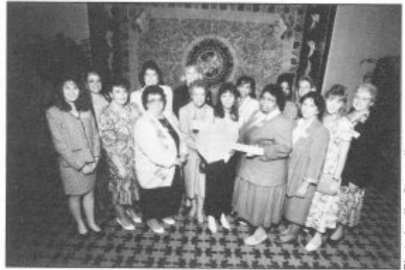
Reston Center secretaries during their recent visit

Of Reston Center's 885 employees, sixteen are secretaries, with four in St.