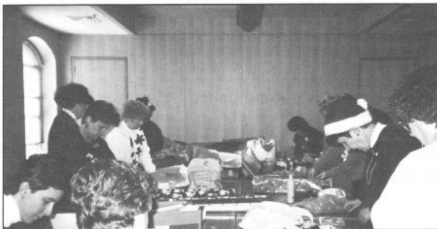
The 'elves' were all wrapped up in their work, while visions of pizza danced in their heads.