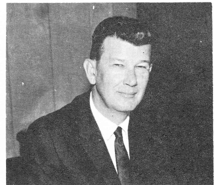
MR. FINNIE NOMINATED FOR NATIONAL ACSM BOARD OF DIRECTORS

Watch for announcements from your publicity Committee for specific dates, time and location.