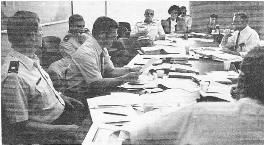
The FLIP Coordinating committee reviews and plans the content and format of Flight Information Publications produced at DMAAC.