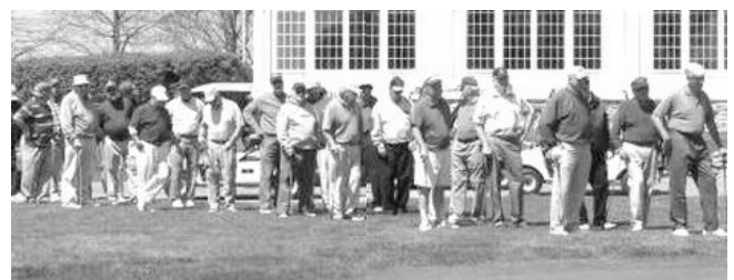
An enthusiastic group after 18 holes 😊