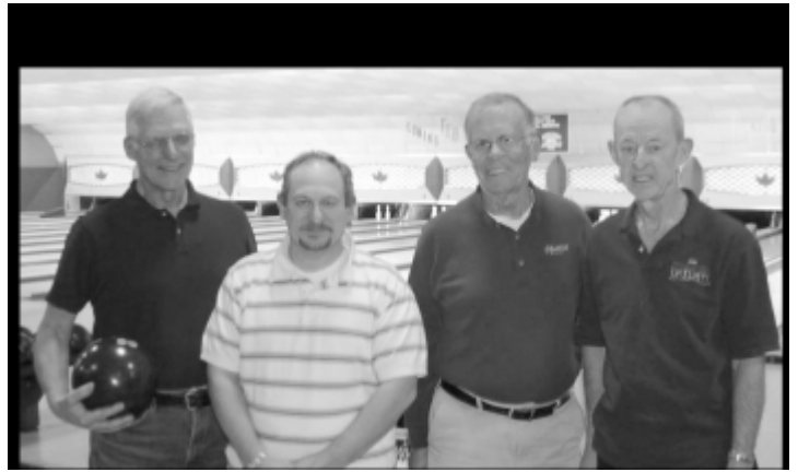
"The Stretch Runners"

If you'd like a sporting glimpse of some of your acquaintances from the past, stop by the Shrewsbury Lanes on any early Thursday evening and watch these guys, young and not-so-young, roll for glory, and occasionally some money.